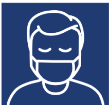
Face coverings are worn when needed

Social distancing must be maintained at all times. Young people and staff/leaders need to remain 1m plus (ideally 2m) apart at all times. The exceptions are to meet any welfare or health and safety needs.