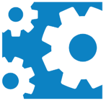
Action plan in place (roles and responsibilities)

Bubbles need to remain no larger than 15 young people (plus staff) and should be structured as organised group work sessions and not open access sessions. Young people should be placed in consistent bubbles for regular sessions and should not swap bubbles during this period unless absolutely necessary. Support/key workers (i.e. for SEND young people) are allowed in addition to bubble of 15 young people.