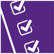
Risk Assessment are up-to-date

All youth sector providers should review, update and implement their COVID Secure Action Plan. More details on developing your action plan can be found in our main version 3 guidance document here: https://nya.org.uk/guidance/ .