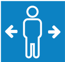
Social distancing is in place

NB: Sector providers must ensure their safeguarding policy is current and used to protect young people from harm.