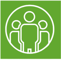
Groups/Bubbles are manageable (age appropriate)

Bubbles need to remain no larger than 15 young people (plus staff) and should be structured as organised group work sessions and not open access sessions. Young people should be placed in consistent bubbles for regular sessions and should not swap bubbles during this period unless absolutely necessary. Support/key workers (i.e. for SEND young people) are allowed in addition to bubble of 15 young people.